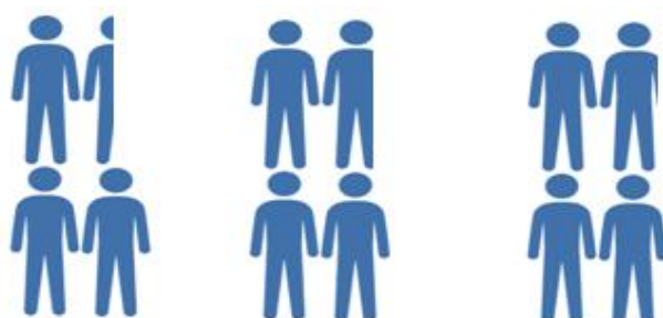
Figure 1: Population Density in Cabusao